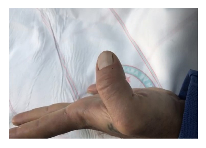
Figure 1. Preoperative picture of a patient with loss of extension of the thumb